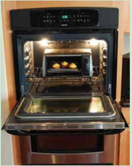
Another energy-smart gift is a toaster oven (set inside an oven for comparison), since it requires less energy to heat than a standard oven.