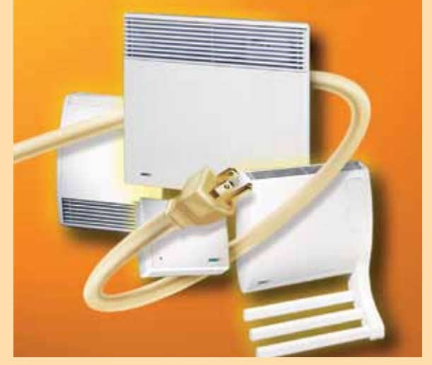
Plug-in and hard-wired units available only from your electric co-op