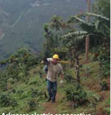
Arkansas electric cooperative lineworkers during their 2013 trip.