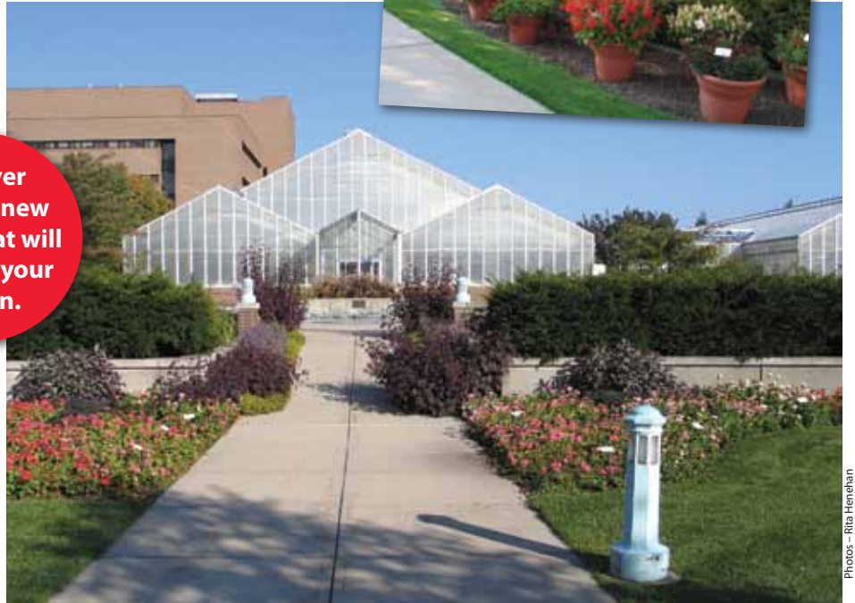
Top: View hundreds of container plants on trial at the MSU annual plant trial garden.

Discover exciting new plants that will thrive in your garden.