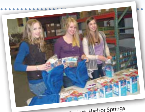
Manna Food Project, Harbor Springs

“Without grant assistance such as the People Fund, our Food 4 Kids Backpack program would not be making a difference in the lives of children in our area. The Great Lakes Energy People Fund is such a wonderful assistance to so many organizations in our area, serving a variety of needs. Thank you for being there.”