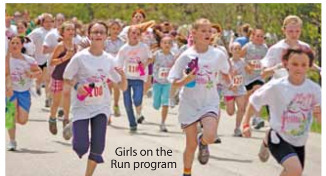
Girls on the Run program