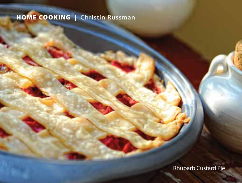
Rhubarb Custard Pie