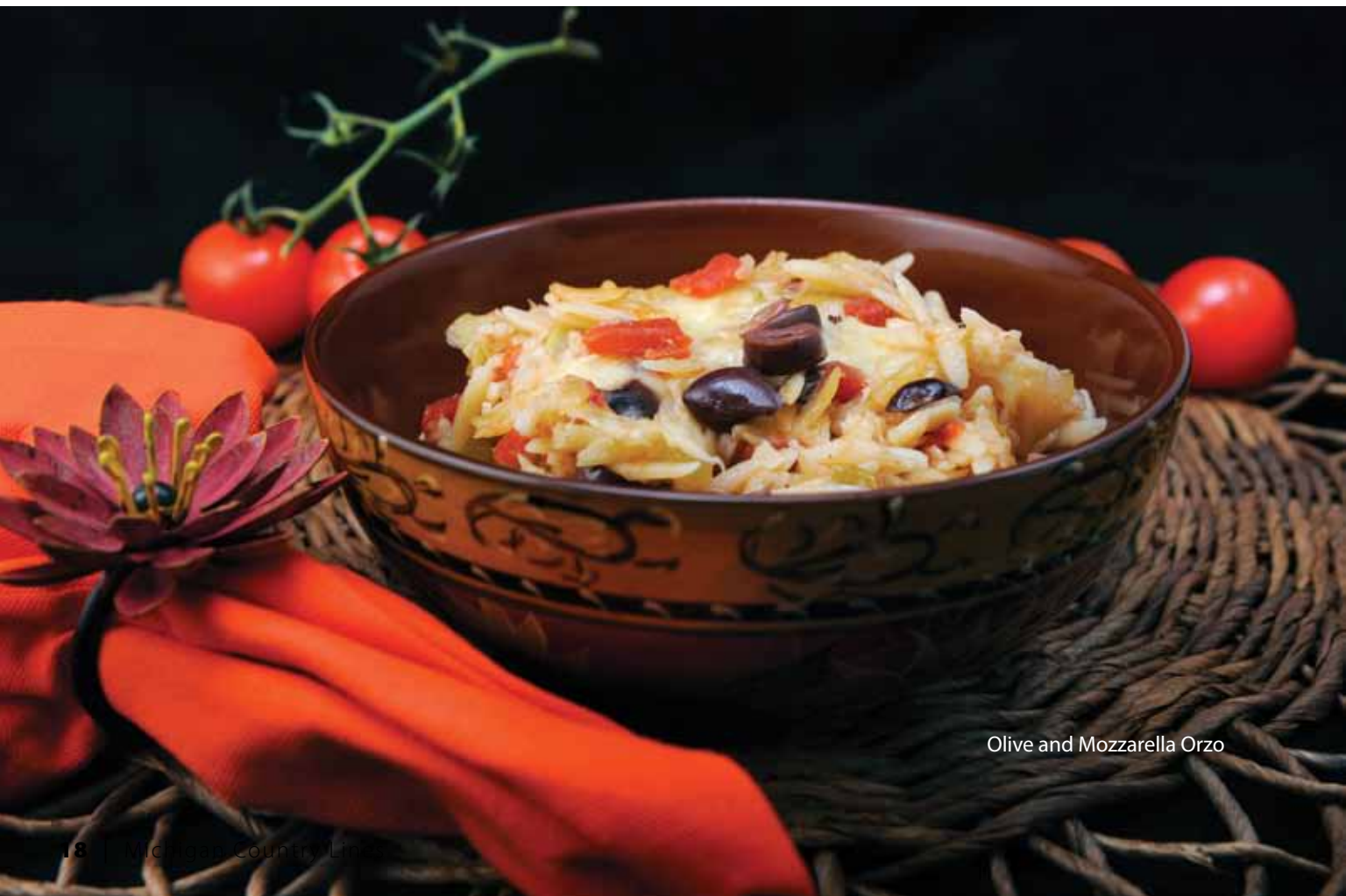
Olive and Mozzarella Orzo

Add 1/4 cup of broccoli mixture placing in