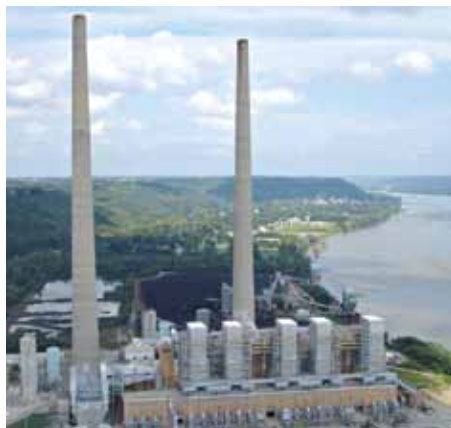
Wolverine is serving its members with baseload power from the Clifty Creek power plant (L), one of the two OVEC plants, and renewable energy from the Harvest Wind Farm.

“OVEC consists of two coal-fired plants, one located in Indiana and the second in