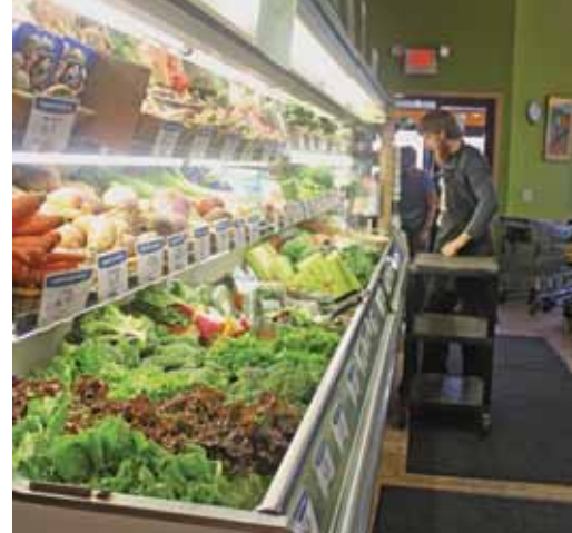
Above: Shopping at the Marquette Food Co-op. Below: Planting in a hoophouse extends the growing season.