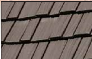
Country Manor Shake in Mustang Brown

Toughness and low maintenance requirements make metal roofing perfect for the demanding needs of agricultural applications. Each roof is hand crafted and finished with custom made trims and accessories by installers with a minimum of 300 hours of training. Available in a variety of colors.