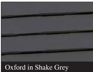
Oxford in Shake Grey