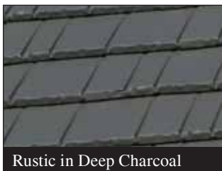
Rustic in Deep Charcoal

*Promotion may not be combined with any other offers. Some restrictions apply. Call for details. Promotion is based on approved credit. Applies to purchases made on American Metal Roofs consumer credit program. $222.00 monthly payment calculations based on financing $20,000 at 7.0% APR for 10 years.