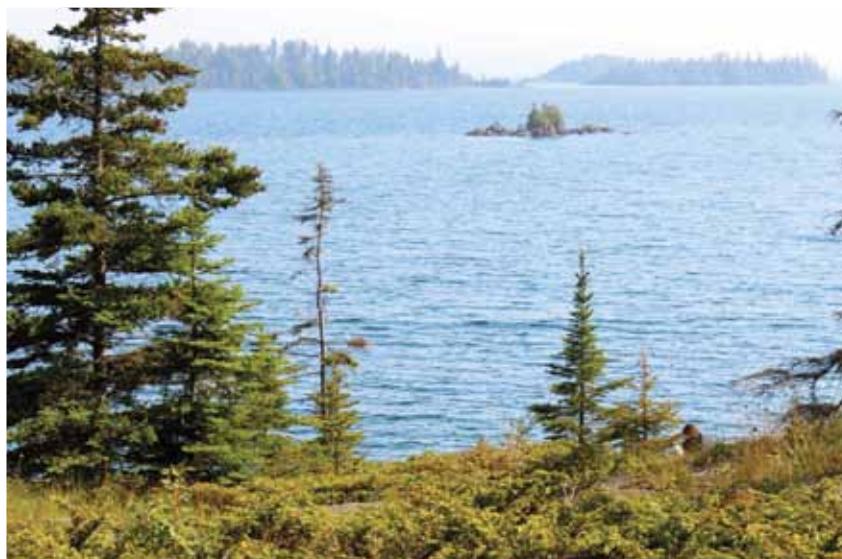
Can you find the young woman reading a book on the shore of Isle Royale?

Nature's delicate balance is most troublesome for the island's wolves now, as scientists consider whether to import wolves from the mainland to refresh the pack. Without new blood for 18 years—the wolves must cross frozen Lake Superior from Minnesota or Canada—the pack has dwindled to eight members, leaving the moose to multiply to 900 or so. The moose population obviously likes this arrangement. (You'd think 900 moose would be enough incentive for the wolves. Or, just put up a billboard on the Canadian shore of Lake Superior: a picture