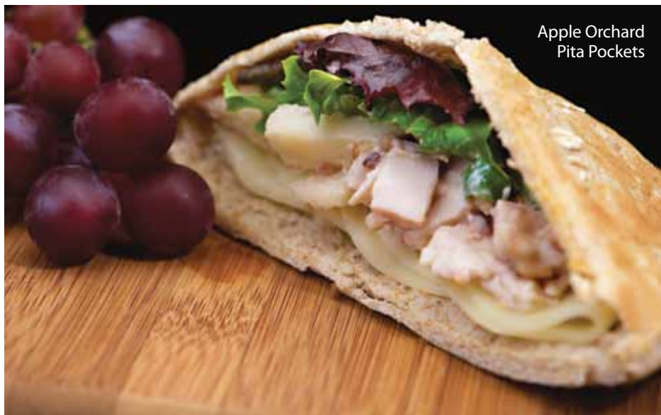
Apple Orchard Pita Pockets

Submit your recipe! Contributors whose recipes we print in 2013 will be entered in a drawing to win a prize: Country Lines will pay their January 2014 electric bill (up to $200)! The 2013 winner will be announced in the January 2014 issue.