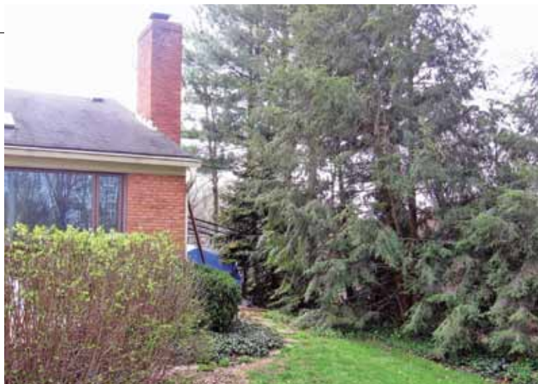
A row of hemlocks on the north side of a home block cold winter winds. They do not block the sun because it does not swing that far to the north during winter.

Low-growing ground cover near your house can help to keep it