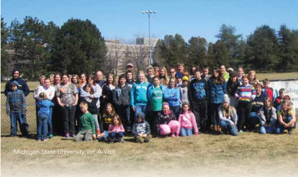
Michigan State University Vet-A-Visit