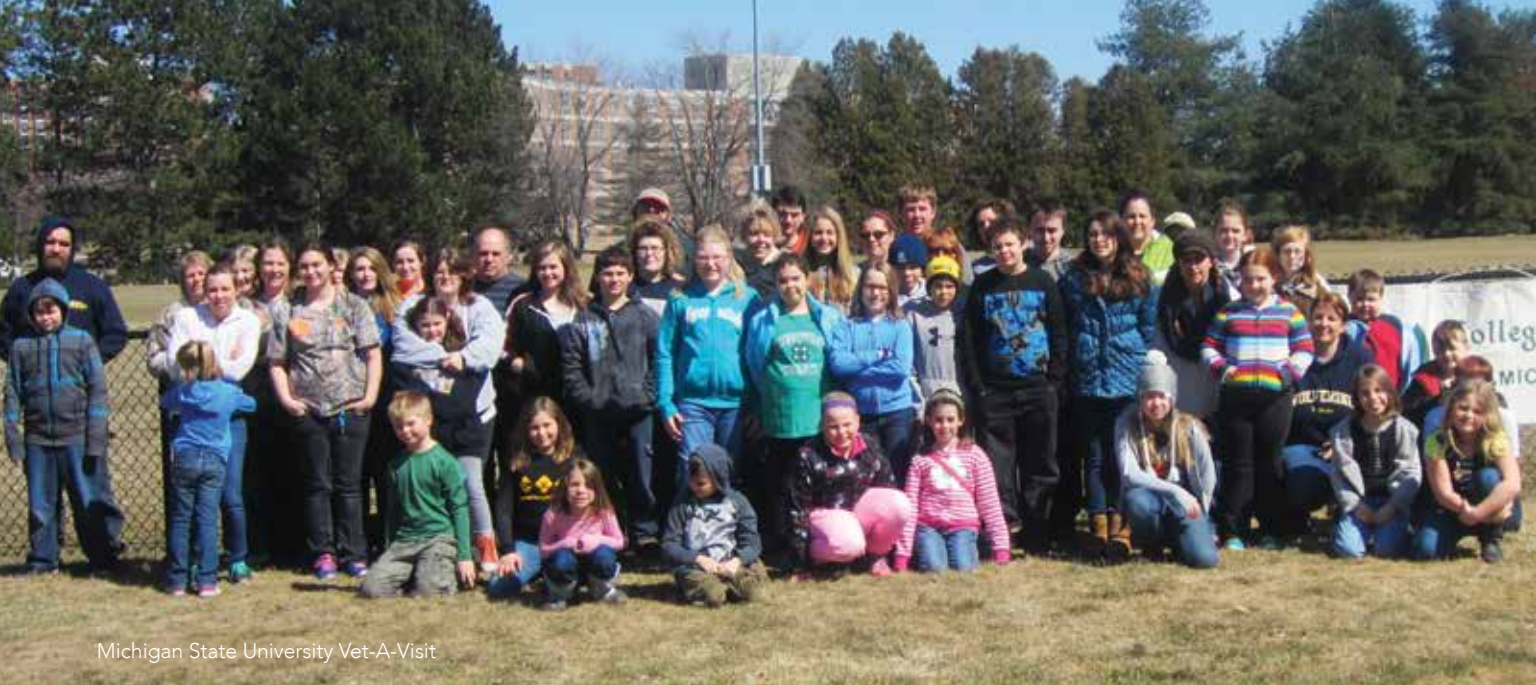
Michigan State University Vet-A-Visit