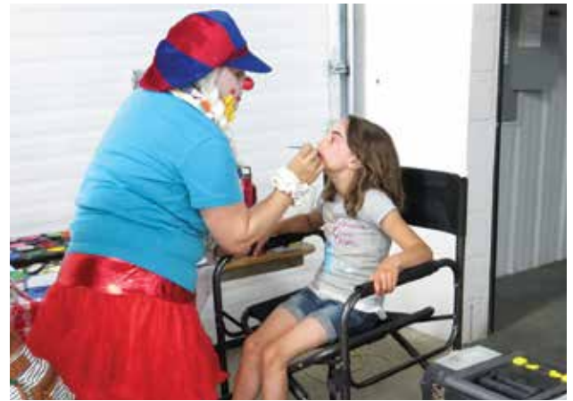
Poopeck the clown provided face painting and entertainment to young attendees.