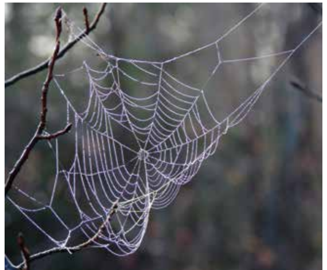
Photography has helped me get over my fear of spiders and snakes. It's a lot of fun to try to capture the delicate work of the spiders, especially when they're covered in early morning dew