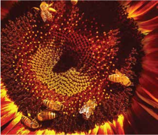
These honeybees were working diligently on a 10-foot mammoth sunflower