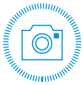
Photo Contest Furry Friends