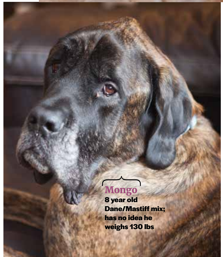
Mongo 8 year old Dane/Mastiff mix; has no idea he weighs 130 lbs