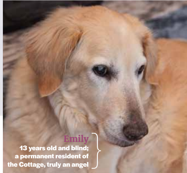
Emily 13 years old and blind; a permanent resident of the Cottage, truly an angel

In a typical shelter older dogs are often overlooked for more energetic puppies, while the terminally ill dogs are often euthanized. Over 2,000 senior dogs are without homes within 500 miles of Traverse City, she learned. Skarritt-Nelson’s heart couldn’t take it.