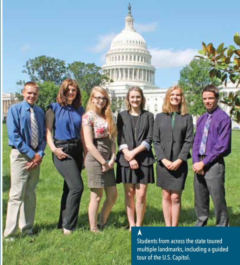
Students from across the state toured multiple landmarks, including a guided tour of the U.S. Capitol.

Michigan's electric cooperatives sponsored 22 high school juniors and seniors on this once-in-a-lifetime trip to Washington, D.C. this past June.