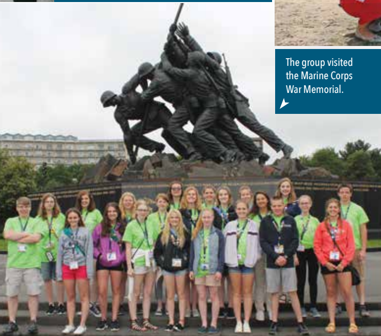
The group visited the Marine Corps War Memorial.