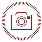
Photo Contest Fan Spirit