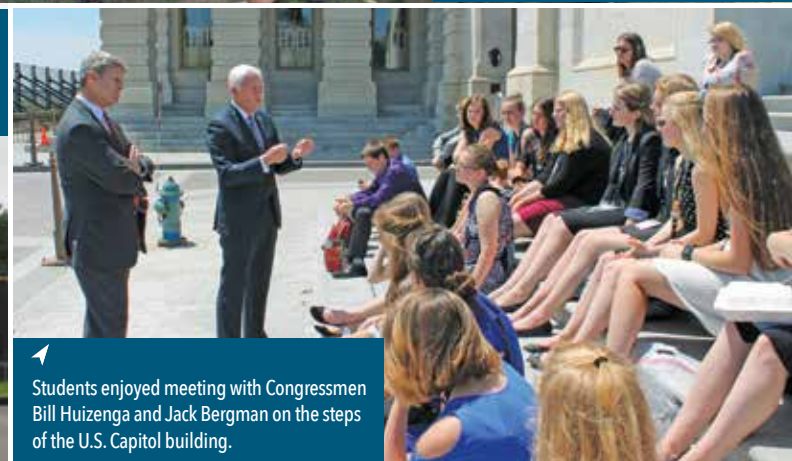
Students enjoyed meeting with Congressmen Bill Huizenga and Jack Bergman on the steps of the U.S. Capitol building.

Information is available at CooperativeYouthTour.com