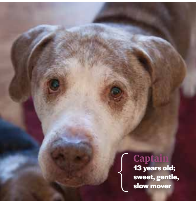
Captain 13 years old; sweet, gentle, slow mover

By Emily Haines Lloyd