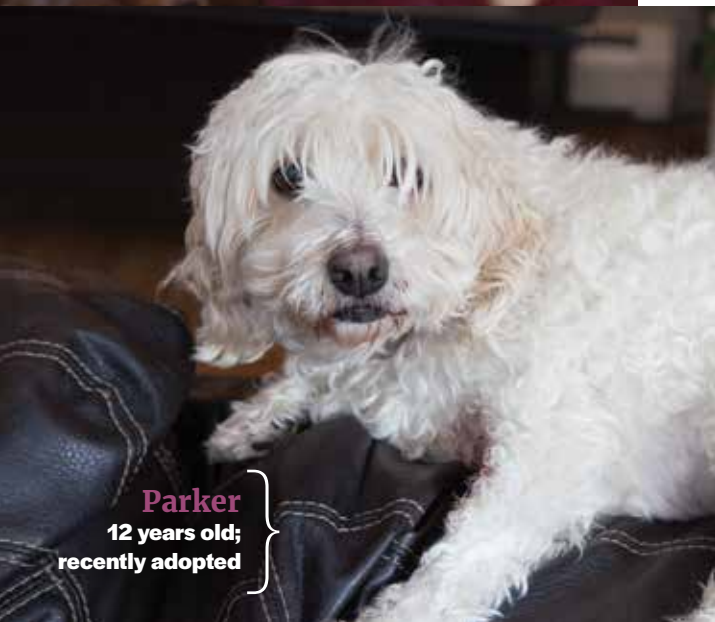
Parker 12 years old; recently adopted