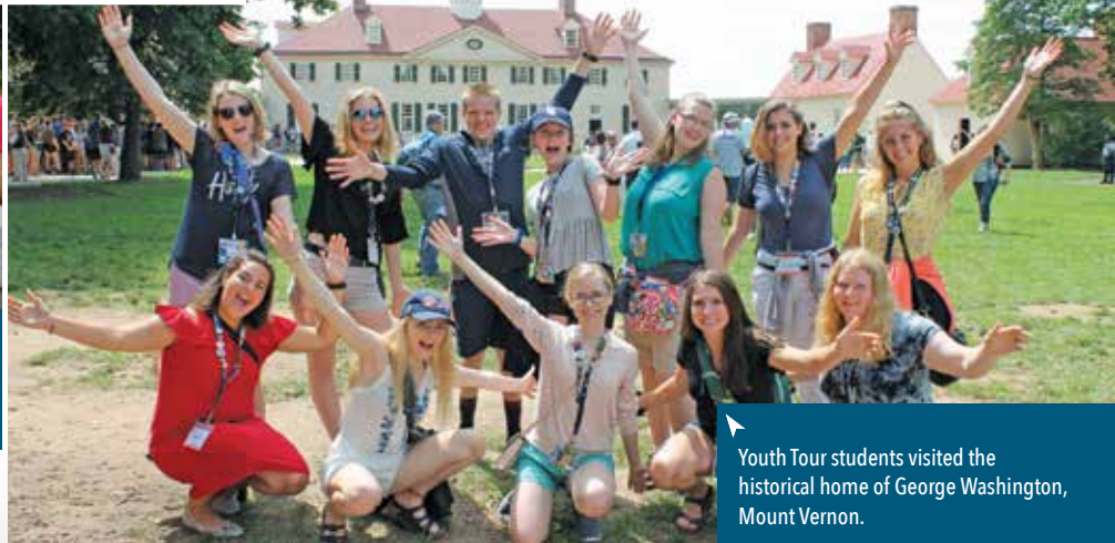
Youth Tour students visited the historical home of George Washington, Mount Vernon.