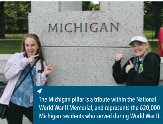
The Michigan pillar is a tribute within the National World War II Memorial, and represents the 620,000 Michigan residents who served during World War II.