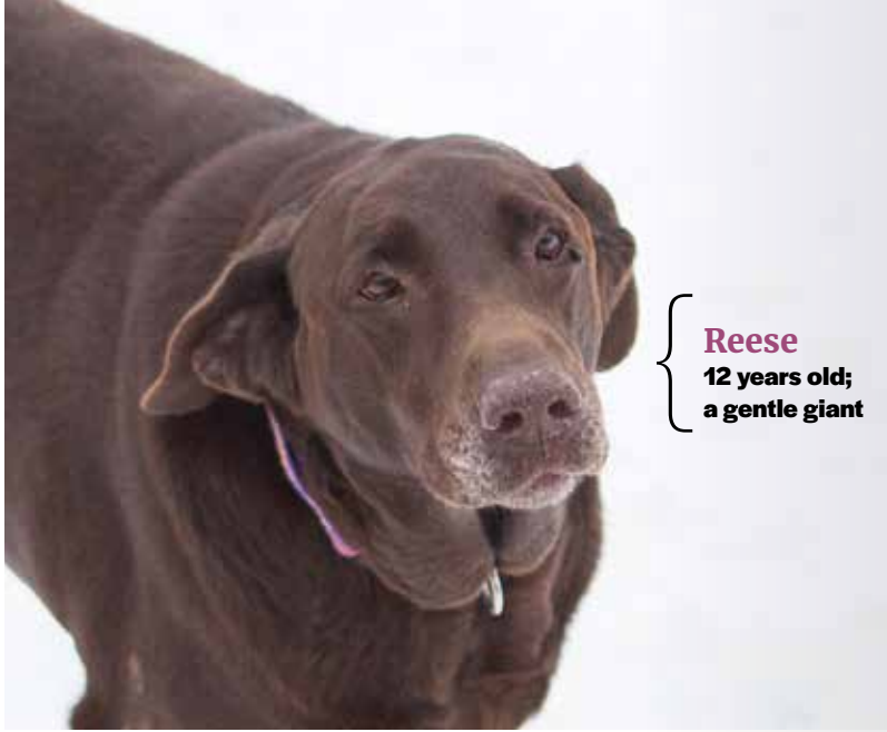
Reese 12 years old; a gentle giant